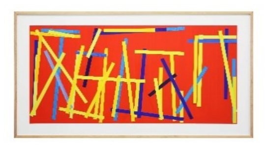
2007/ 2009 Fishing Red I E. 60x120 cm Acrylic on paper strips, collaged