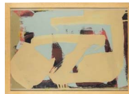
1983 Untitled 73,5x98 cm Enamel on layered