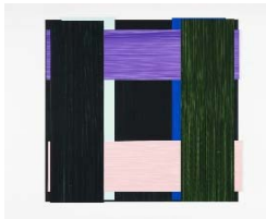
2016 Face 75 Ed. 36x36cm Acrylic on plastic foil