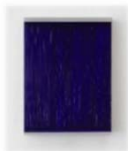
2016 Tafel DCCLXVII 19,6x14x3,5 cm Acrylic on aluminium, wood