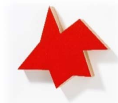
1994 Kinderstern 38,5x43x9 cm Acrylic on wood