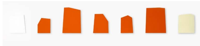
2012 Nummer 9B-15B 45,1x301,4x1 cm Acrylic on aluminium