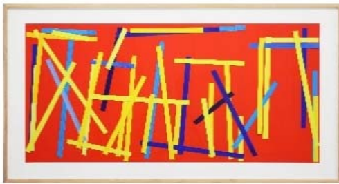
2007/ 2009 Fishing Red I E. 60x120 cm Acrylic on paper strips, collaged