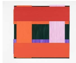
2016 Face 87 Ed. 36x36cm Acrylic on plastic foil