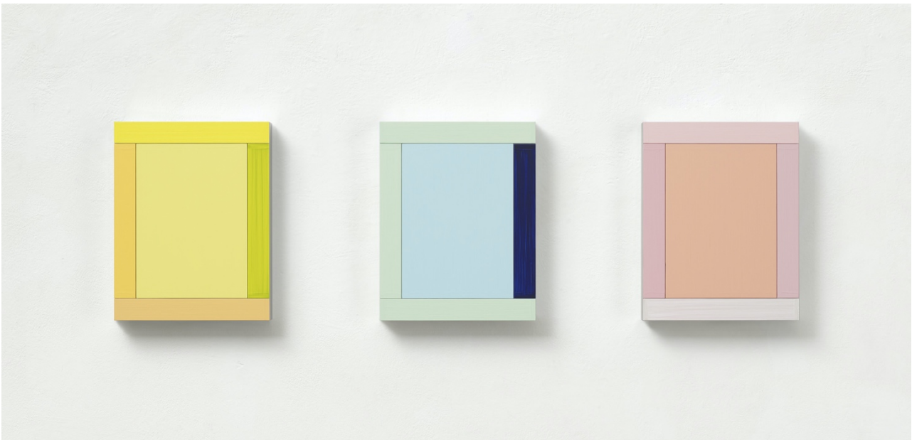
Imi Knoebel, Anima Mundi 106-3, 2019, 37x127x5,8 cm. Courtesy Dep Art Gallery, Milano

Milan, September 2021 - Dep Art Gallery is pleased to announce the exhibition "Painting Color Space" dedicated to Imi Knoebel (Dessau, 1940), one of the best-known artists devoted to minimalism and constructivism, which opens the gallery's new exhibition season from October 7th 2021 to January 15th 2022 .