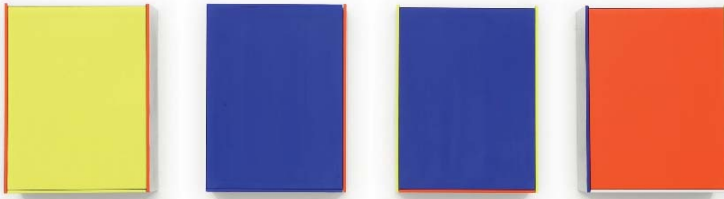
1994 DIN II A1-A4 36,7x132,5x8 cm Acrylic on aluminum on wood