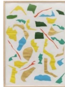
1977 Messerschnitt VI 100x70 cm Acrylic on paper