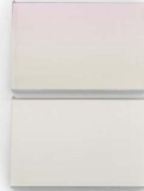
2006 Twin 4 144x99x6 cm Acrylic, aluminium, plastic film