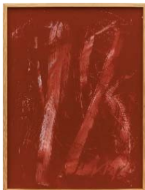
1990 Zeichnung 2 103x74 cm Reverse glass painting on plexiglass with lacquer