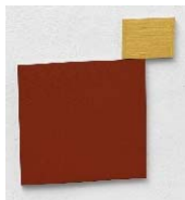
2018 Element 39.1 34,5x30,9x1 cm Acrylic on aluminium