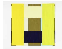
2016 Face 88 Ed. 36x36cm Acrylic on plastic foil